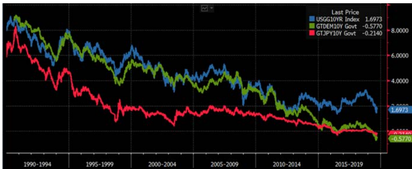
USGG10YR – US Treasury 10 year; GTDEM10YR – EUR Government 10yr; GTJPY10Y – Japan Government 10yr as of 24 September 2019

With more and more bonds at negative yields, we should be cognisant that a bond bubble may be forming. While we are getting more concerned on bonds valuation, we also recognize that the current environment continues to favour bonds even in these low yields: (i) Global economy is slowing and recession risks increasing (ii) Central banks are back to coordinated easing (iii) The investment world is fraught with risks ranging from trade war, currency war, political uncertainties and terrorists attacks.